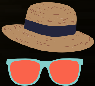
Cap / Hat Sunglasses