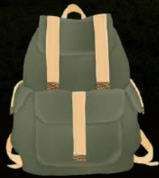
20 Ltr Small Bag Use for Sightseeing